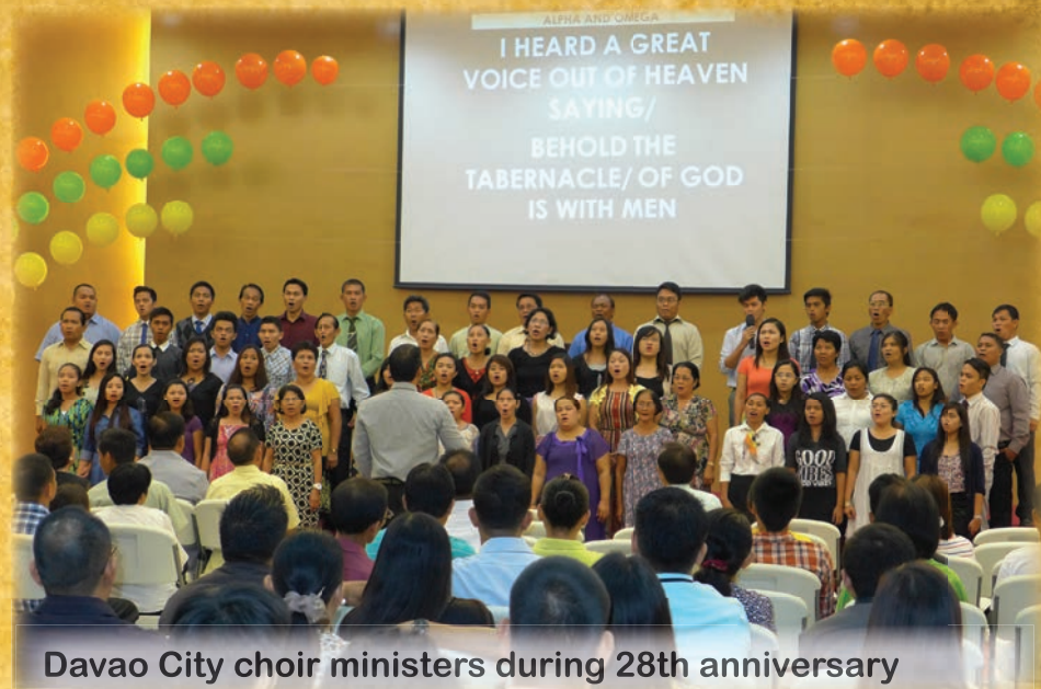
Davao City choir ministers during 28th anniversary