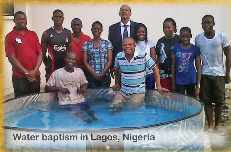
Water baptism in Lagos, Nigeria