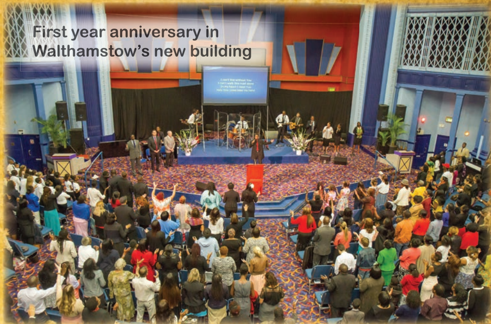
First year anniversary in Walthamstow's new building