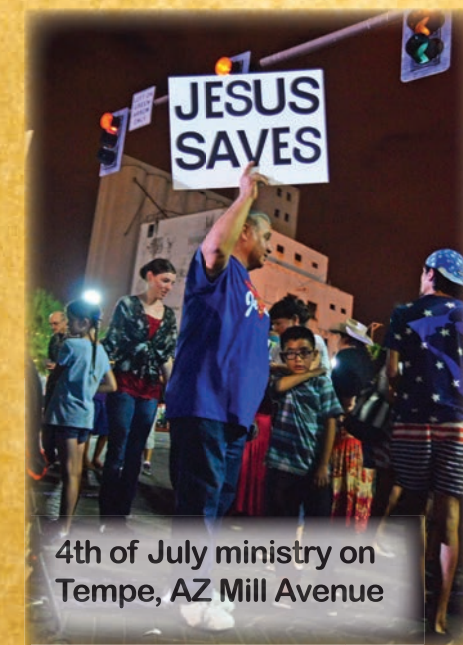
4th of July ministry on Tempe, AZ Mill Avenue

Continue to pray for us out here in Arkansas, as we pursue the establishment of a fellowship church. Arkansas for Jesus!