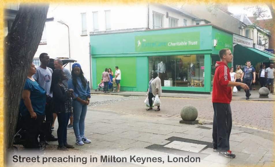
Street preaching in Milton Keynes, London