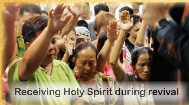
Receiving Holy Spirit during revival