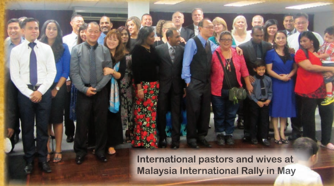
International pastors and wives at Malaysia International Rally in May