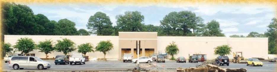
Norfolk, Virginia's church was donated by real estate owner