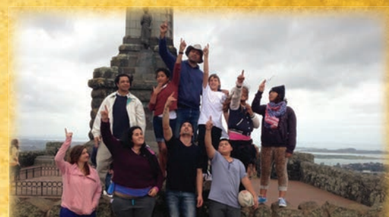
Outreach teams have greatly helped the Tauranga church

The most noticeable was a young Turkish lady who came in with crutches. After prayer she was jumping around the stage full of joy! Even off stage she was still thanking God and crying out to Him. Another very remarkable miracle was the healing of a woman who had pain in her knees for more than 13 years. She also got powerfully healed by the blood