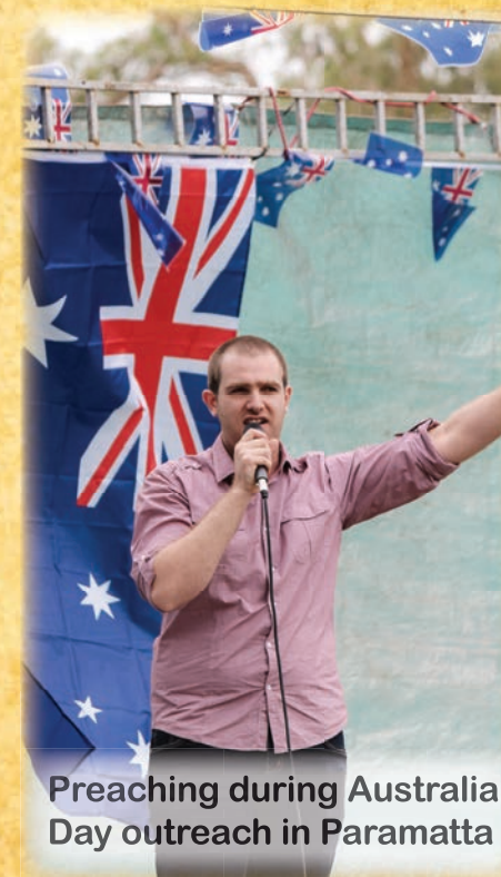
Preaching during Australia Day outreach in Paramatta