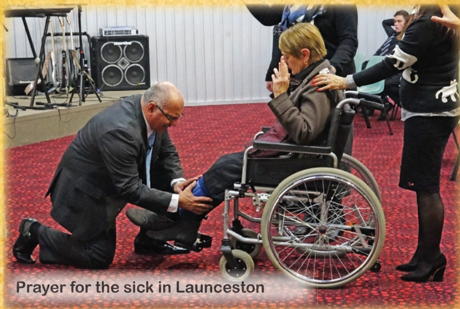
Prayer for the sick in Launceston