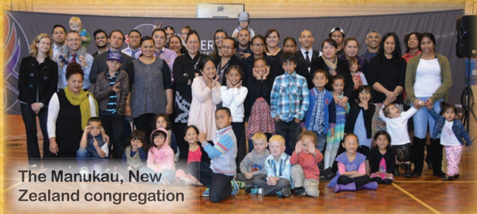
The Manukau, New Zealand congregation

We have had tremendous favour with our local council and have just started to take our concert ministry into