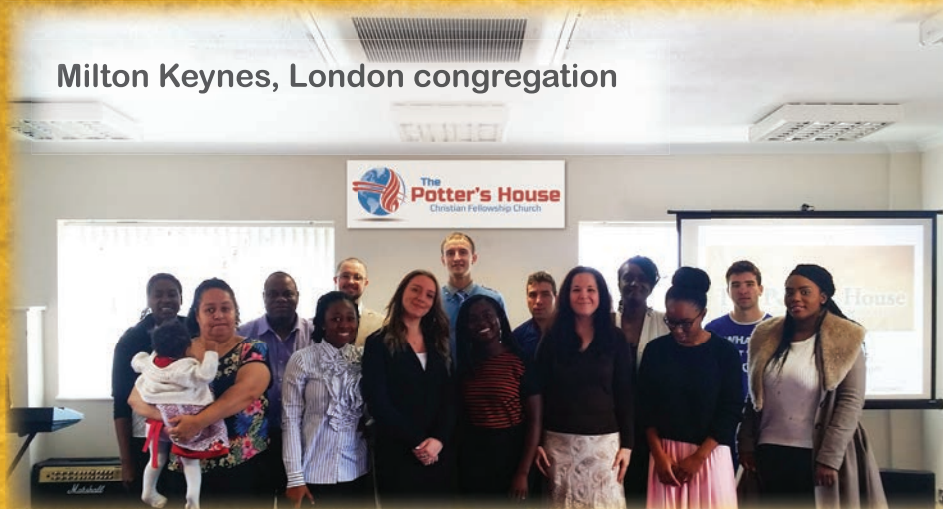
Milton Keynes, London congregation

We bring a fantastic report of all that God has done for us here in Milton Keynes, a city 50 miles north of London, UK.