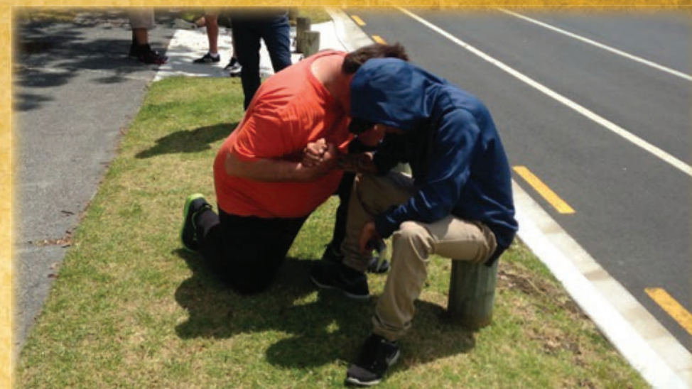
Another soul is brought into the Kingdom in Tauranga, NZ