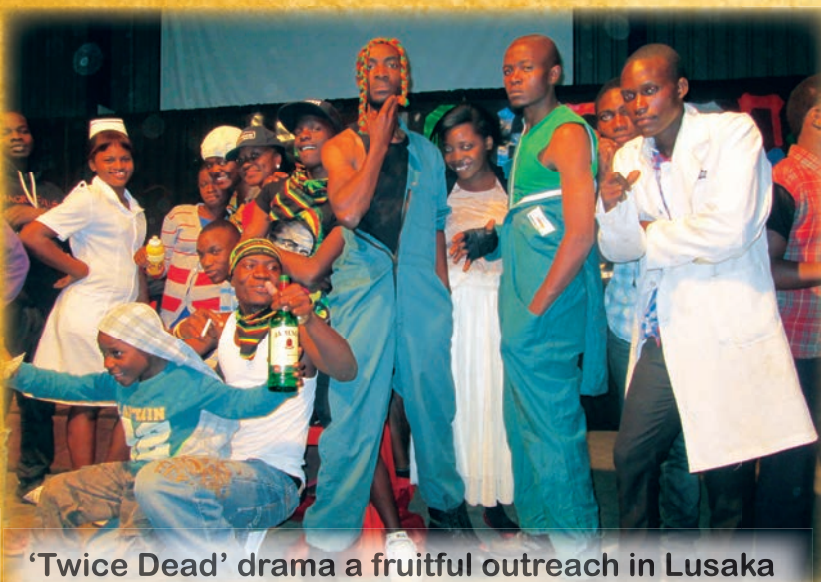
'Twice Dead' drama a fruitful outreach in Lusaka