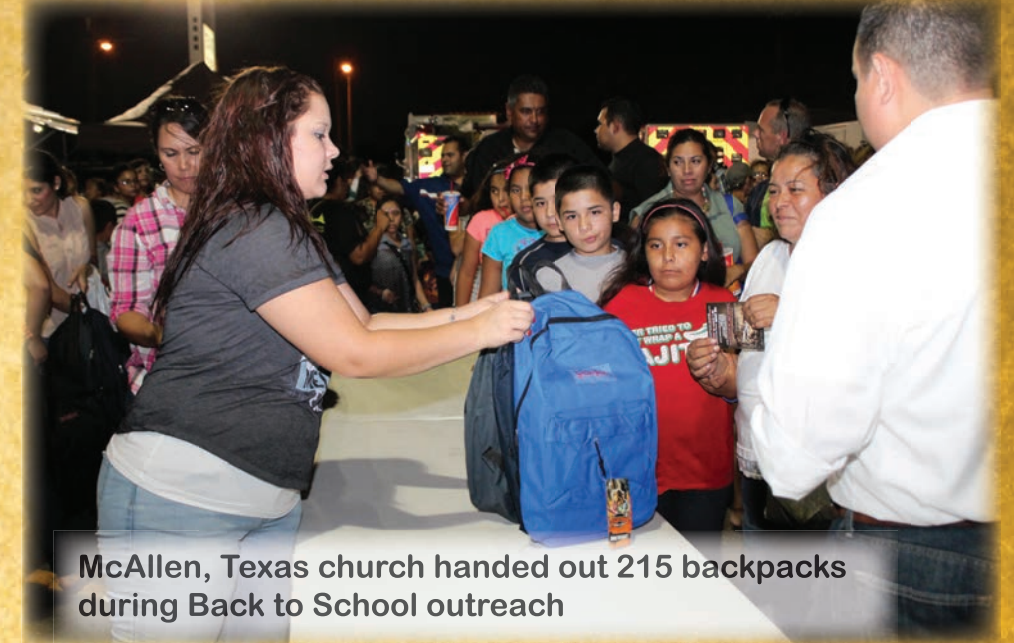
McAllen, Texas church handed out 215 backpacks during Back to School outreach