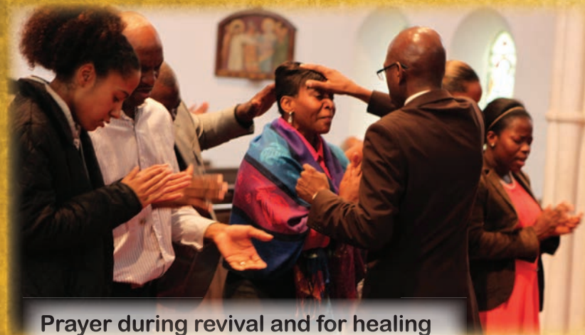
Prayer during revival and for healing in Shepherds Bush, London