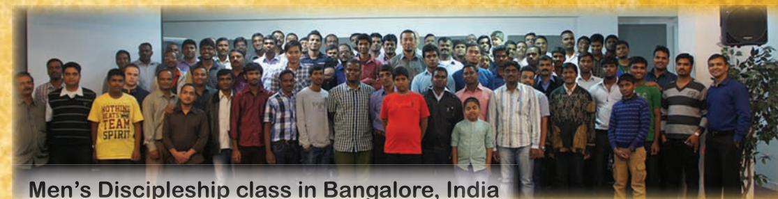
Men's Discipleship class in Bangalore, India

the streets and coming into our Music Scenes and church services and giving their lives to Jesus is a common sight.