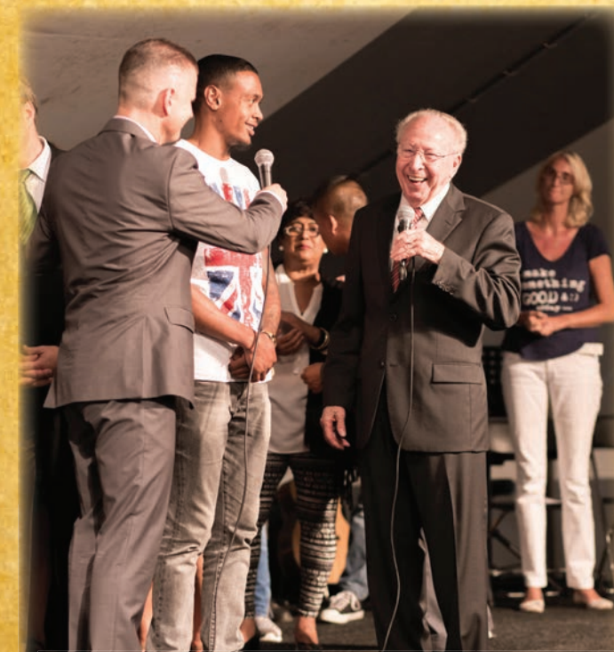
Healing crusade in The Hague, The Netherlands saw many notable miracles

W e had a powerful time with the annual healing crusade with