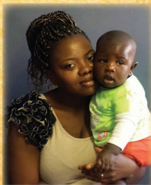
Southport, Queensland woman's child completely healed of eczema

Keep praying for the church in Southport. God, who has begun a great work here, will be faithful to complete it! Amen!