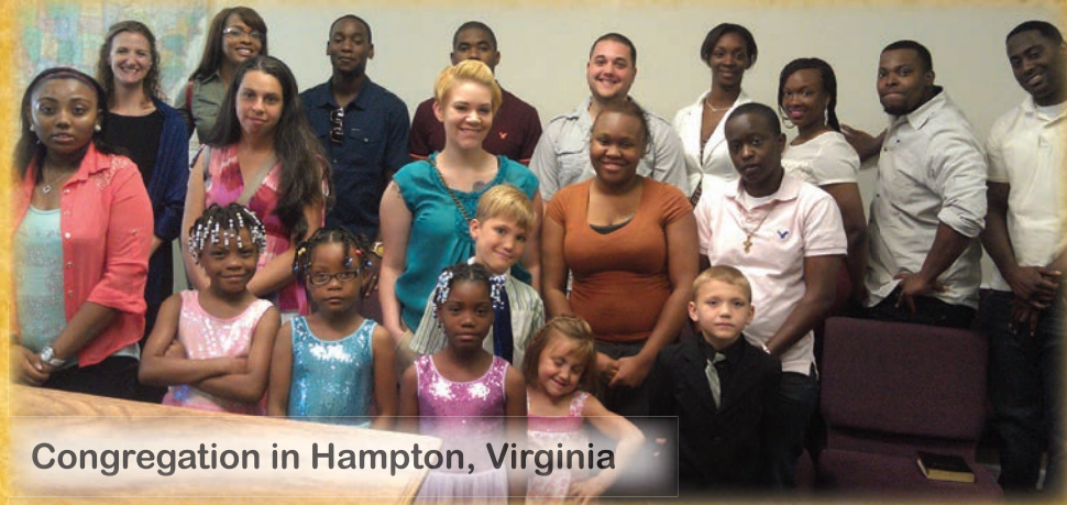
Congregation in Hampton, Virginia

We were blessed in June to get in a building, a place to call home. During our Grand Opening, we saw an amazing 21 people in service, almost all adults! Many of those in attendance