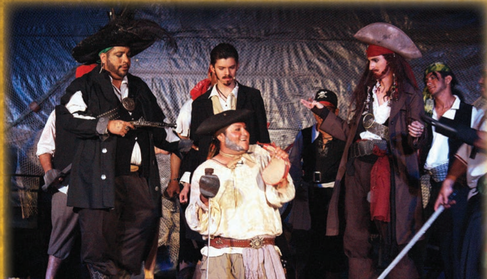
Pirates of the Caribbean drama at McAllen, Texas

revival), 40 people got saved and about 25 people were filled with the Holy Ghost. Many people were healed and some people were given a Word.