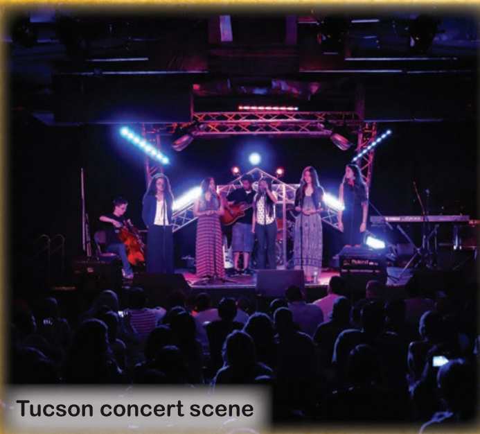
Tucson concert scene

On International Night we were pleased to announce a new work into Brazzaville, Congo. Another exciting Africa-related announcement was that we were also able to nationalize our churches in Benin and Cameroon by raising up local workers.