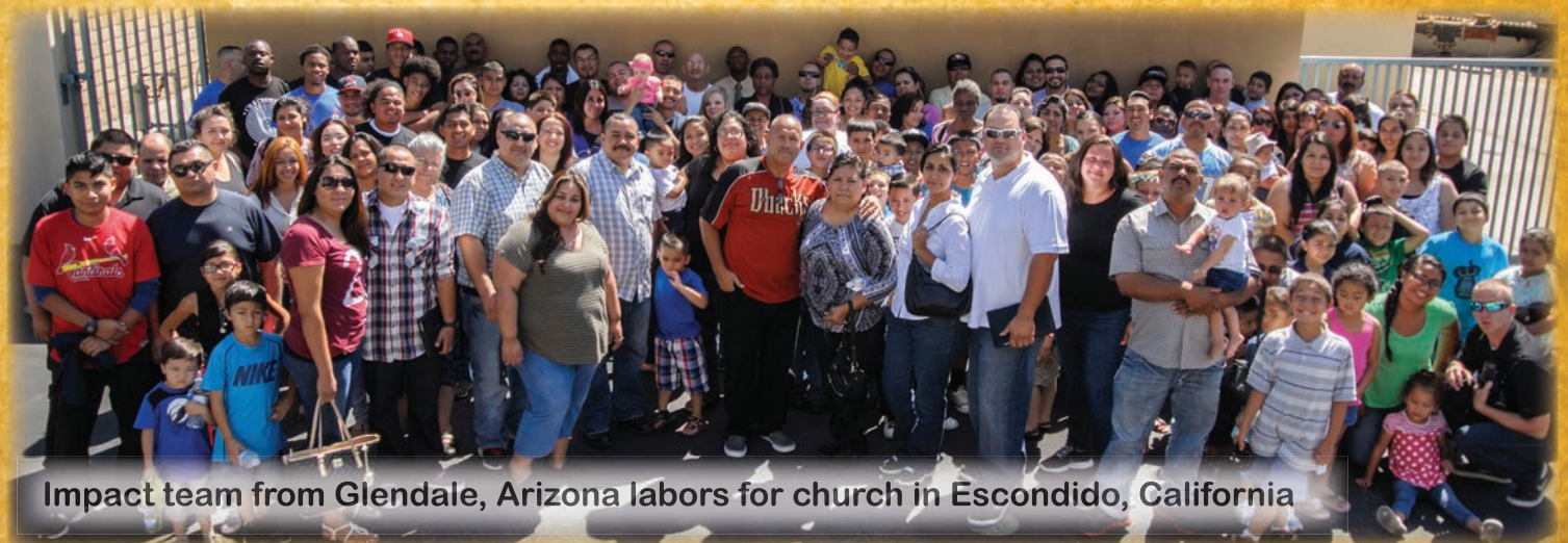
Impact team from Glendale, Arizona labors for church in Escondido, California

I can only imagine what people thought as they saw this immense guerrilla team taking to the streets. We had