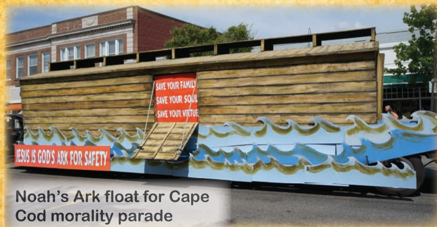
Noah's Ark float for Cape Cod morality parade

On the church planting front, our new missionary work in Croatia opened in May, less than one year after