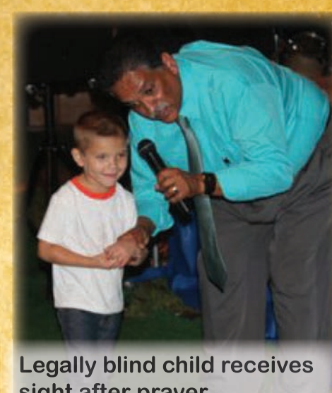
Legally blind child receives sight after prayer

Glory to God for the favor He has given us here in Oklahoma City.