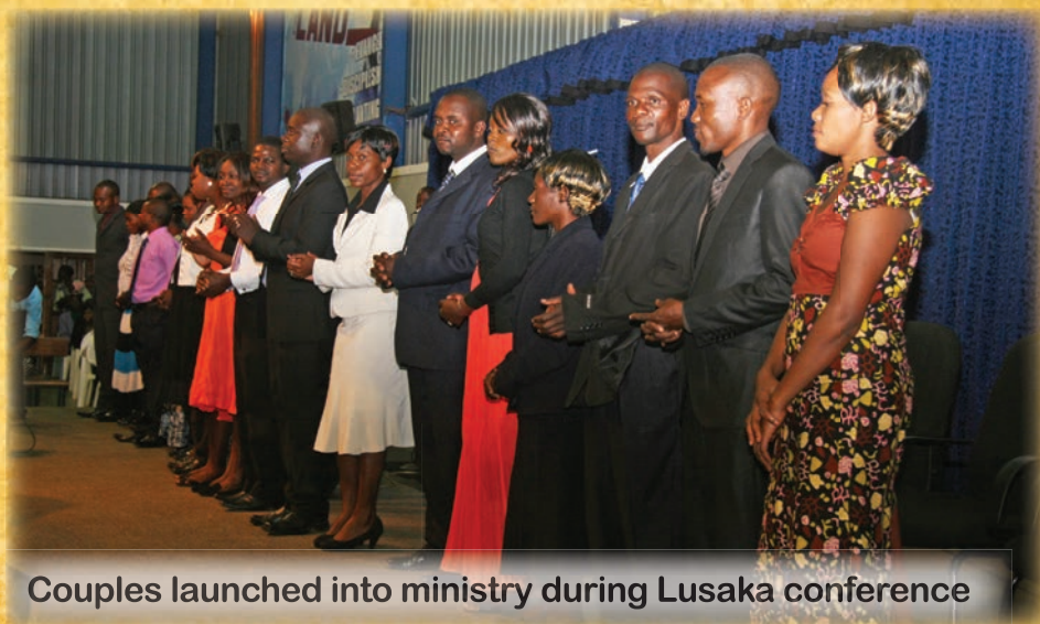
Couples launched into ministry during Lusaka conference