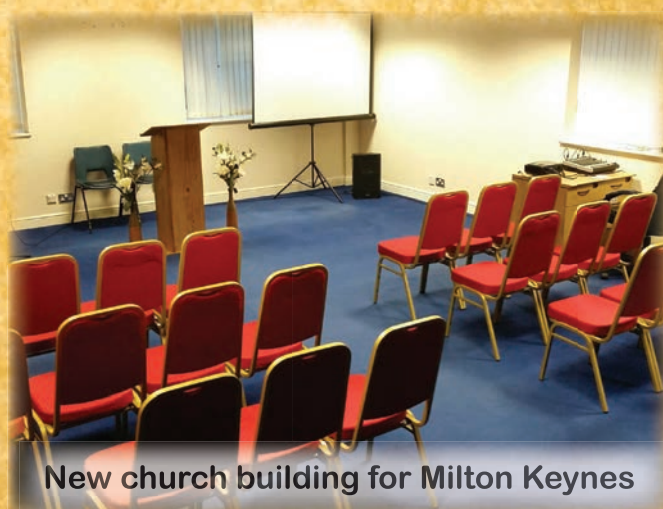
New church building for Milton Keynes